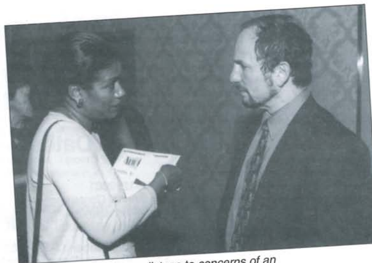
Senator Paul Wellstone listens to concerns of an AFCC conference participant.